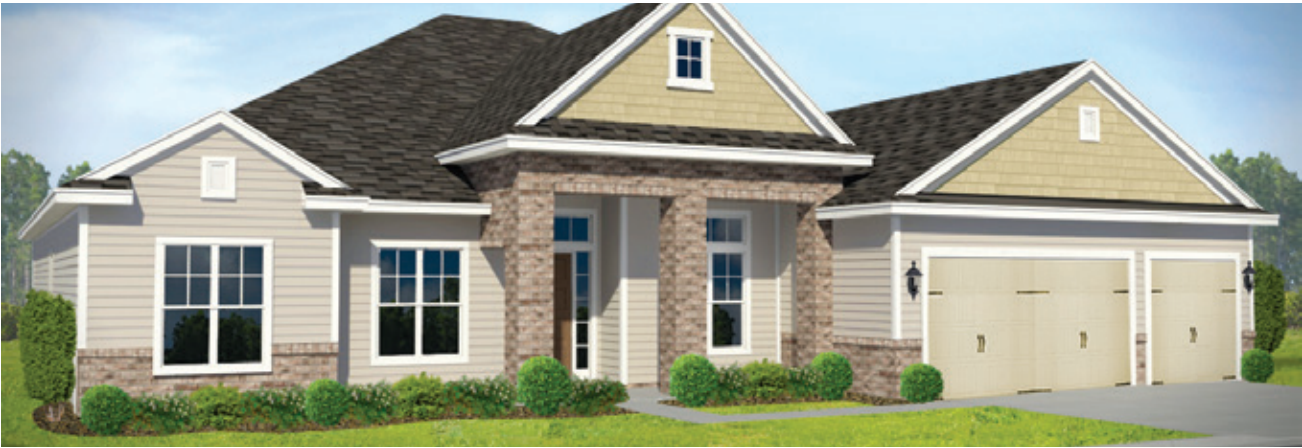
ELEVATION C BRICK