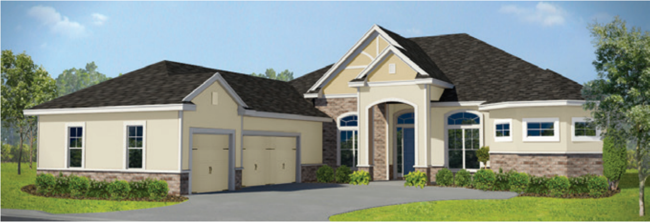
ELEVATION C BRICK